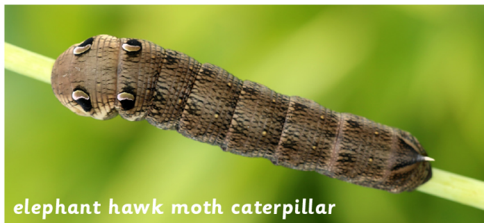
elephant hawk moth caterpillar